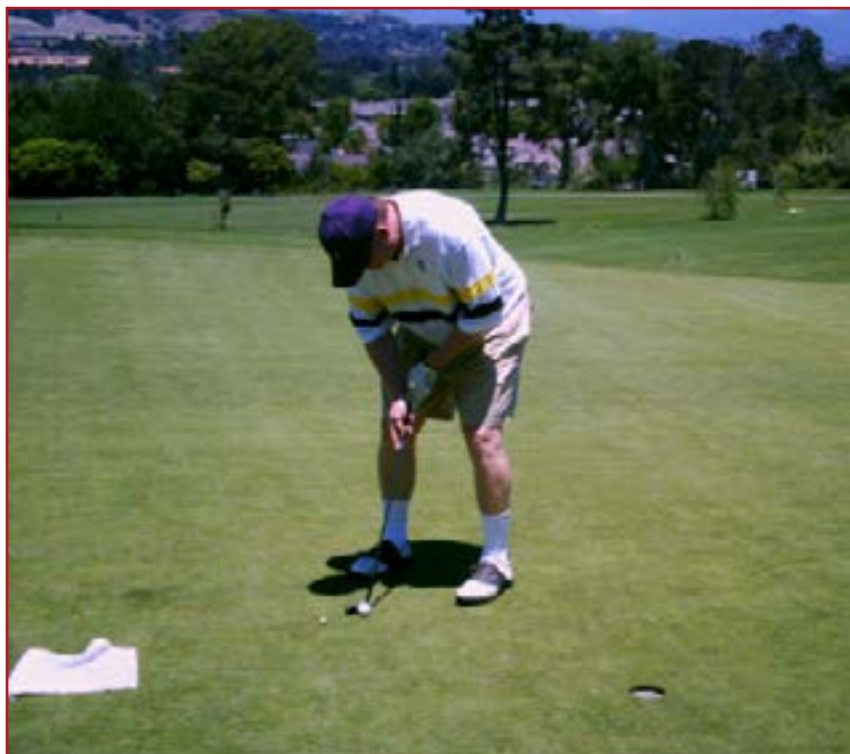
FORE: Golfer attempts short put in a past KofC Golf Tournament. This year's edition is set for 12:30 p.m. on June 28 at San Juan Hills Golf Club.